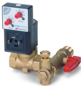
Electronic Drain Valves