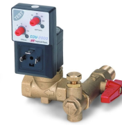
Electronic Drain Valves