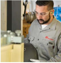
Field Overhaul Services