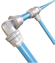
SimplAir Compressed Air Piping