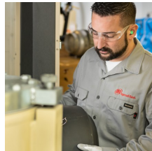
Field Overhaul Services