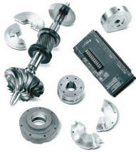
MSG® TURBO-AIR® Centrifugal Compressor Replacement Parts