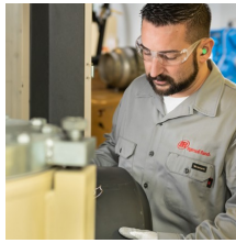
Field Overhaul Services